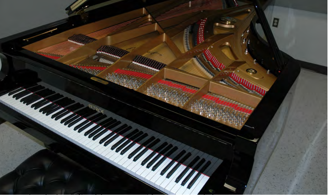
The technology (left) and the instruments (above) are among the best in Grayson County.

If you would like to stop in to find out more, Adult Forum is Sunday at 10 a.m. and Service is at 11:15 a.m.. Stay after for "Conversations and Calories"!