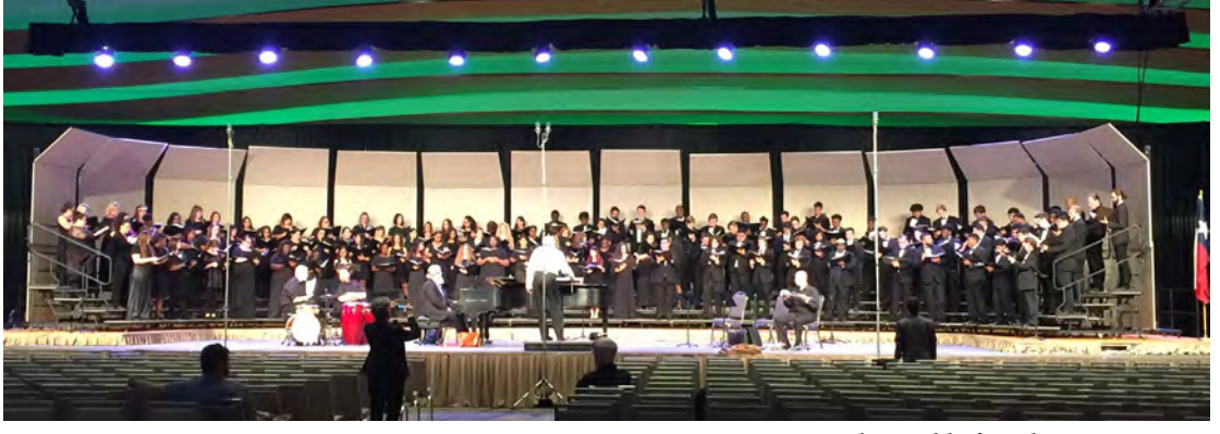
Rehearsal before the concert.

The week was capped off with the Texas Two-Year All-State Choir Concert held at the convention center in the Stars at Night Ballroom on Saturday, February 11th at 7:30 pm.